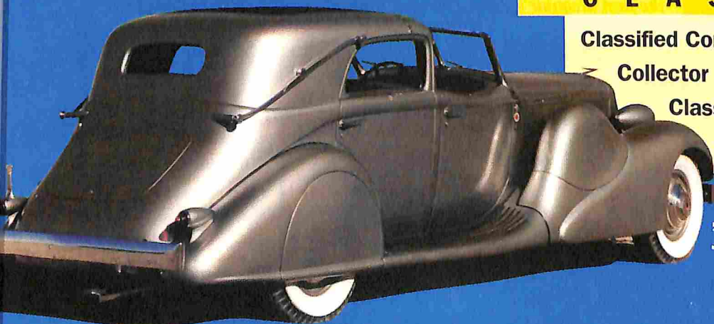
'35 Duesenberg Town Car ... 52