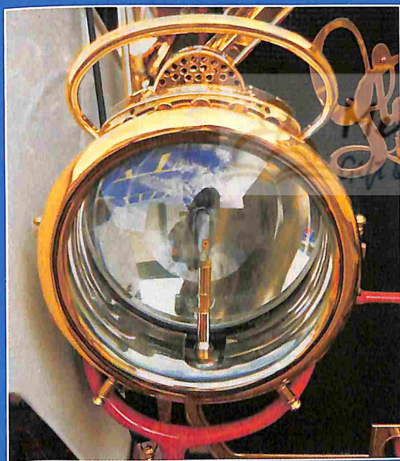
'11 Oldsmobile Limited Touring ... 28