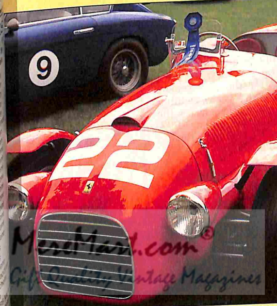
Meadow Brook Concours ... 28