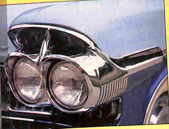
'57 Mercury Turnpike Cruiser. ... 10