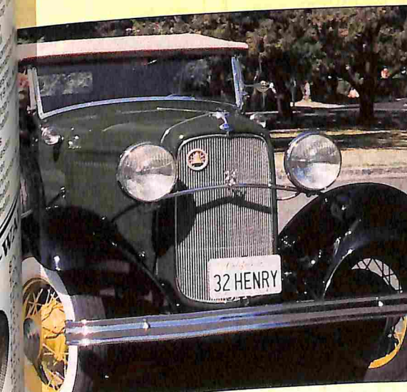
'32 Ford Phaeton ... 52