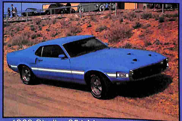
1969 Shelby 351 Mustang Fastback