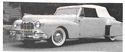
1947 Lincoln Cont. conv. ... $26,000, p. 119