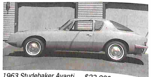
1963 Studebaker Avanti ... $23,000, p. 147