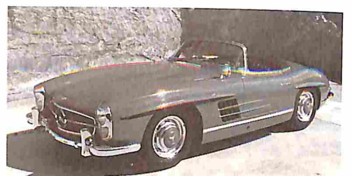
1958 Mercedes 300 SL ... p. 48