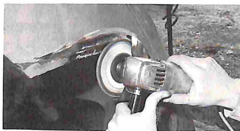
Fender patching ... p. 28