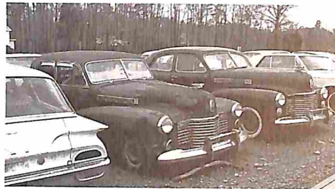
Richard's Auto Parts ... p. 8