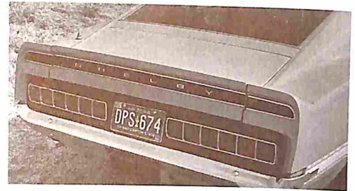
1969 Shelby GT 350 ... p. 20