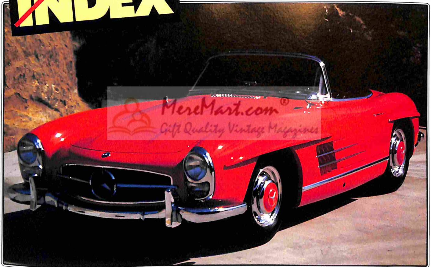
1958 Mercedes-Benz 300 SL Roadster