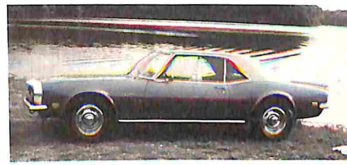
1968 Chevrolet Camaro ... 36