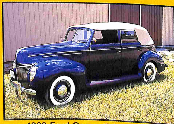
1939 Ford Convertible Sedan