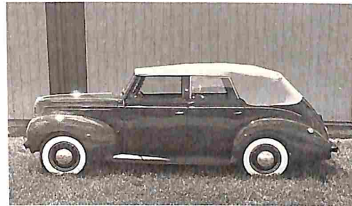
1939 Ford convertible sedan ... 20