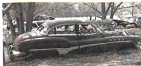
Pike Wrecking in Swanton, Ohio ... 51