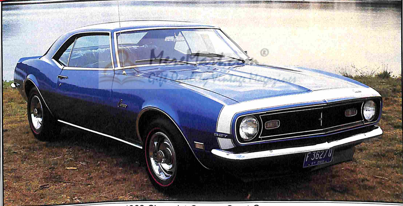
1968 Chevrolet Camaro Sport Coupe