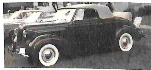
1937 Plymouth conv., $40,000 ... p. 103