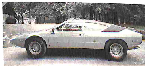
1973 Lamborghini, $26,500 ... p. 126