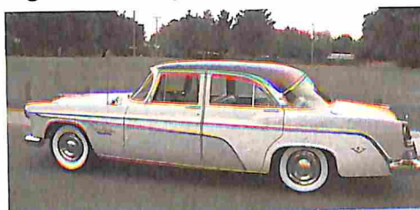
1955 DeSoto Coronado ... 32