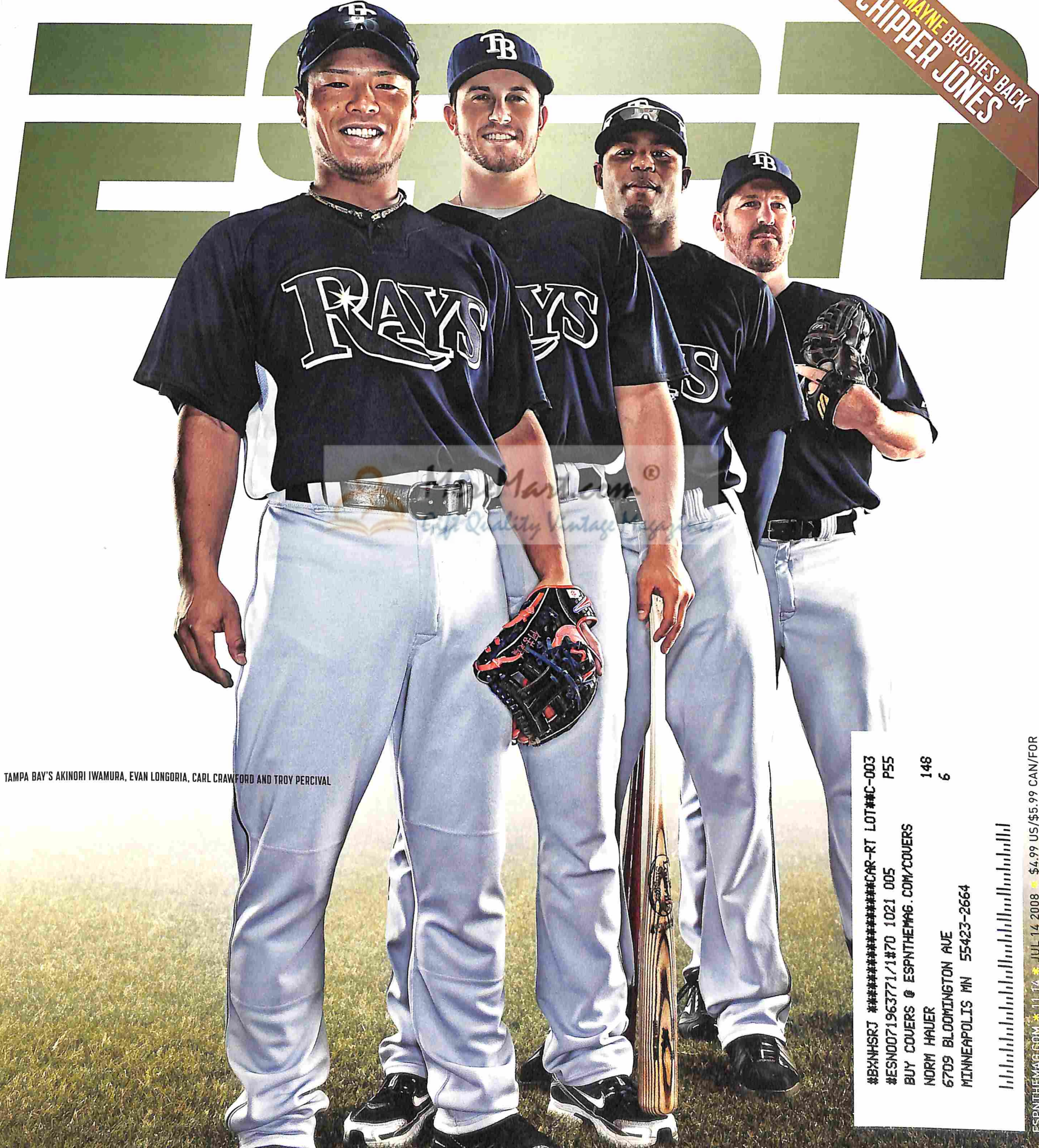
TAMPA BAY'S AKINORI IWAMURA, EVAN LONGORIA, CARL CRAWFORD AND TROY PERCIVAL

#BXNHSRJ *****CAR-RT LOT#C-003 #ESN0071963771/1#70 1021 005 P55 BUY COVERS @ ESPNTHEMAG.COM/COVERS 148 NORM HAUER 6 6709 BLOOMINGTON AVE MINNEAPOLIS MN 55423-2664