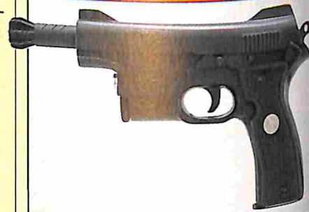
NEW G.I. .45?

GUNS & AMMO MAGAZINE, Copyright 1991 by Petersen Publishing Co. All rights reserved. CAUTION: Some advertisements may concern products that are not legally for sale to California residents or residents in other jurisdictions.