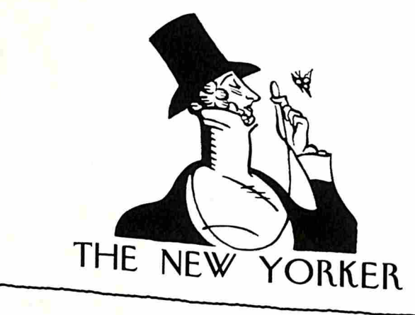
TABLE OF CONTENTS FEBRUARY 11, 1991

Member SIPC © 1991 Charles Schwab & Co., Inc.