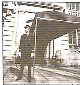
Two-bedroom apartments on Fifth Avenue: $1,000,000 to $2,500,000.