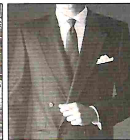
This New Zealand wool suit costs $1,250 on Madison Avenue.