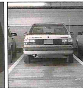
Current rate for 1/2 hr. parking in the Grand Central area: $10 plus tax.

There's a limit to how far you can push New Yorkers. Especially when it comes to inflated prices. They know what an East Side apartment, a cashmere sweater or a dish of pasta is worth. And when the price comes to double or triple that, they're not buying.