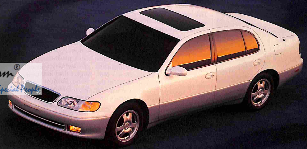
The GS 300 Touring Edition: Leather trim package, Power moonroof, 12-Disc CD auto-changer, Custom alloy wheels, Special edition colors, $3,000 in savings.*

It provides you with almost every possible luxury. Except time.