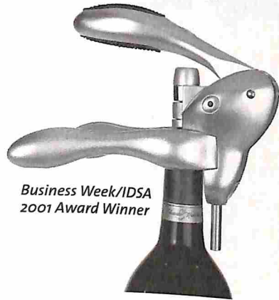
Business Week/IDSA 2001 Award Winner

THE NEW SILVER RABBIT® CORKSCREW WEARS A SHINING SUIT OF ARMOR