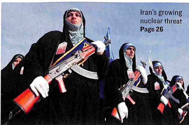
Iran's growing nuclear threat Page 26