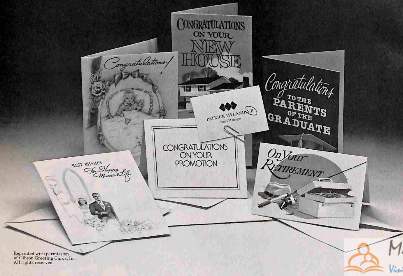
Reprinted with permission of Gibson Greeting Cards, Inc. All rights reserved.

Dennis Wilson , the Beach Boys' drummer and perennial adolescent, drowns in Marina del Rey after a day of partying and a lifetime of summer