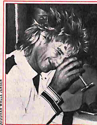
Rod Stewart: acting goofy, 63