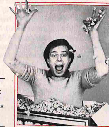
King of diamonds, 72