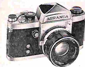
New Miranda FV does everything.

And because it's a Miranda, the FV is a camera you can own with complete confidence. For it's a superb example of the kind of precision craftsmanship and painstaking quality control that enable Miranda cameras to carry the