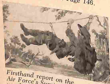
Firsthand report on the Air Force's Survival Test. Could you have passed it? Page 62.