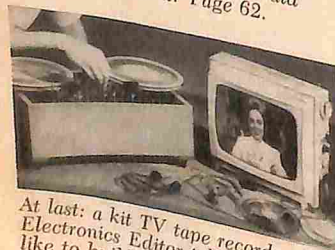
At last: a kit TV tape recorder. PS Electronics Editor tells what it's like to build and use it. Page 102.