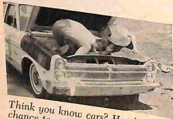
Think you know cars? Here's your chance to match wits with some champion mechanics. Page 146.