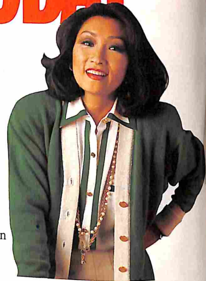
▲ PAGE 6 Anchored Beauty