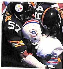
▲ PAGE 18 Black is Tough

80 PROFESSOR P.T. MINDMENDER Aluminum and Alzheimer's.