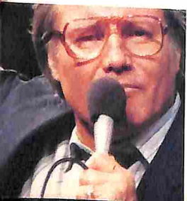
◀ PAGE 6 Passing the Plate