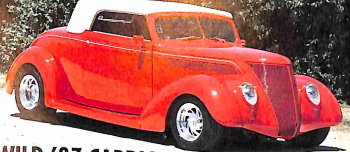
WILD '37 CABRIOLET