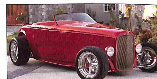
114 A CLOSE LOOK AT THE AMBR WINNER