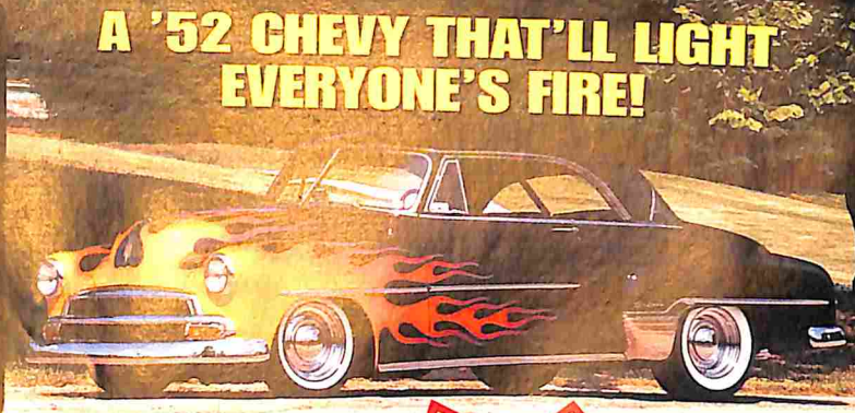
A '52 CHEVY THAT'LL LIGHT EVERYONE'S FIRE!