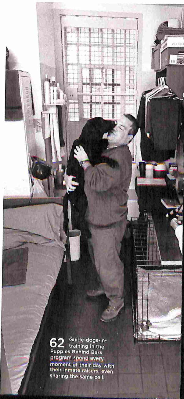
62 Guide-dogs-in-training in the Puppies Behind Bars program spend every moment of their day with their inmate raisers, even sharing the same cell.

"A ROPE was stretched before the runners at chest height, creating a rudimentary starting gate. Contestants eyed the barrier respectfully: the punishment for false starts was a thrashing from official whip bearers." —"LET THE GAMES BEGIN," PAGE 54