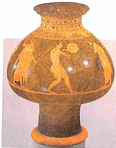
54 The discus can be traced to the first Olympics. So can spectator discomfort.