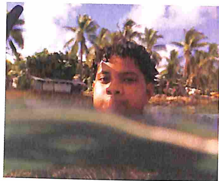
44 One nation, under water? Are the islands of Tuvalu in danger of going under? And why?