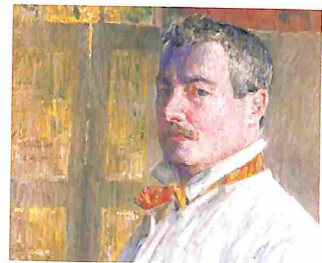
80 Childe Hassam (a 1914 self-portrait) accepted the label of Impressionist only grudgingly.