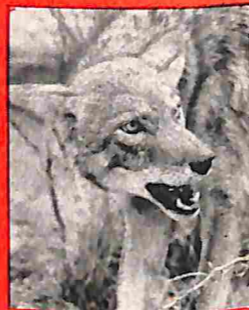
page 58: two experts tell how to outsmart coyotes