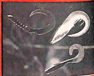
page 44: how to fish the hottest new lure in years