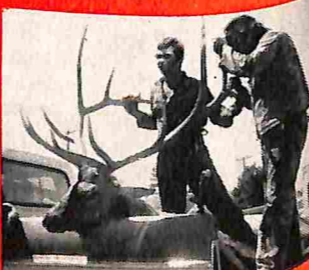
page 56: bowhunting in Arizona for a once-in-a-lifetime elk