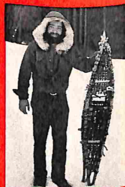
page 50: this man's know-how could save your life