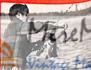
page 70: beauty and adventure for canoeists in Okefenokee