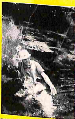
page 44: why and how to fish small, nearby ponds