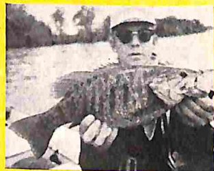
page 68: Tennessee's newest, most productive smallmouth hot spot