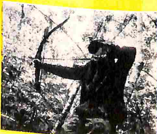
page 51: big, new deer-hunting special for gun and bowhunters