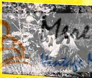
page 66: where to write for all the dog information you'll need