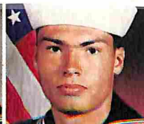
HOGAN AND HARTSON LLP