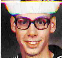
HOLLAND AND KNIGHT LLP