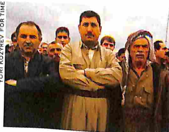
42 ▲ In northern Iraq, Kurds mourn scores of friends killed in a suicide bombing