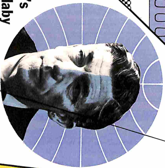
Pan Am's Najeeb Halaby