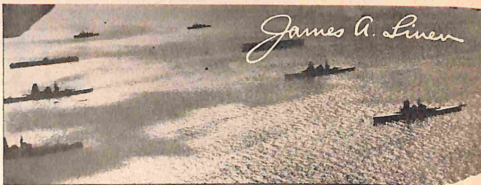
JAPANESE WARSHIPS & PLANES More than a battle was won.