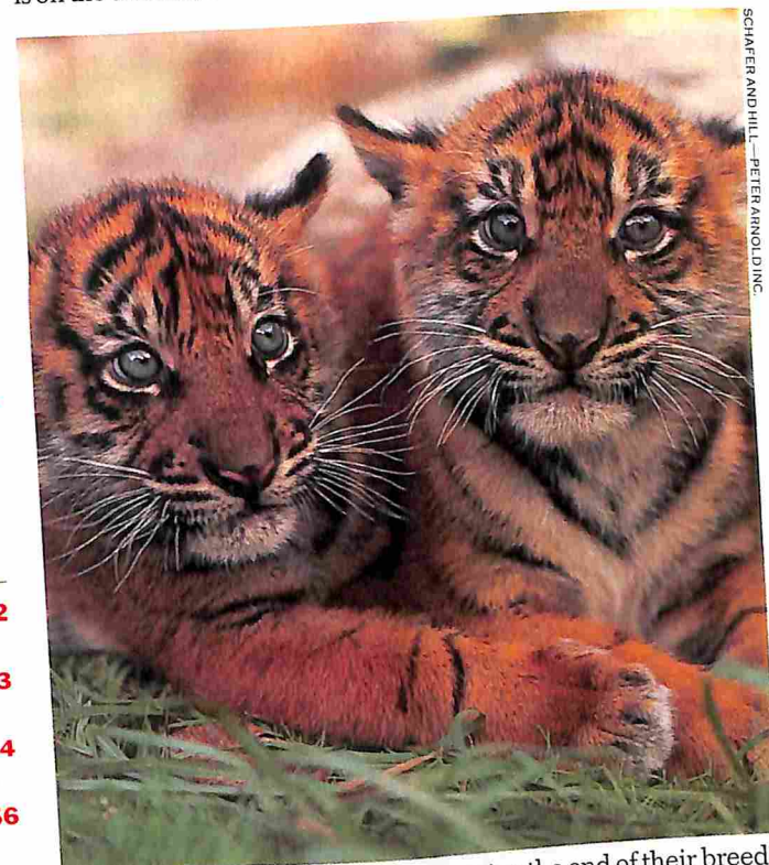
Cover: The world's tigers may be nearing the end of their breed