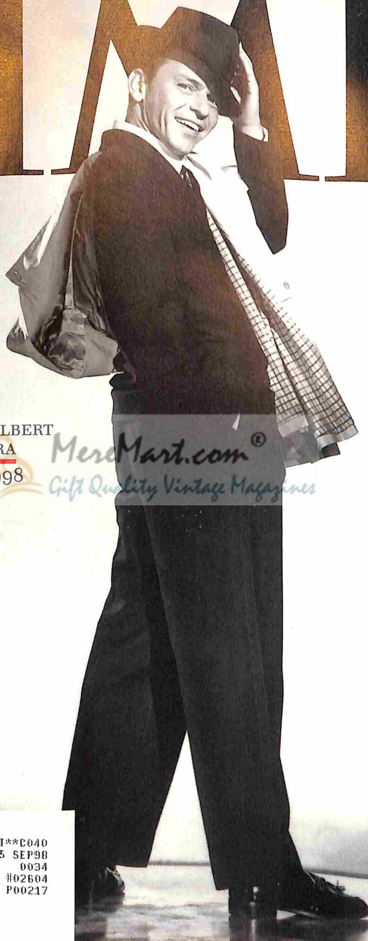
FRANCIS ALBERT SINATRA 1915-1998

MerchMart.com® Gift Quality Vintage Magazines