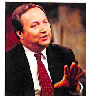
SUMMERS STORM: Women, science and Harvard's chief

THIS WEEK ONLINE .....4 PERISCOPE .....6 THE TECHNOLOGIST .....10 MY TURN .....11 LETTERS .....12 PERSPECTIVES .....17 NEWSMAKERS .....59 GEORGE F. WILL .....60