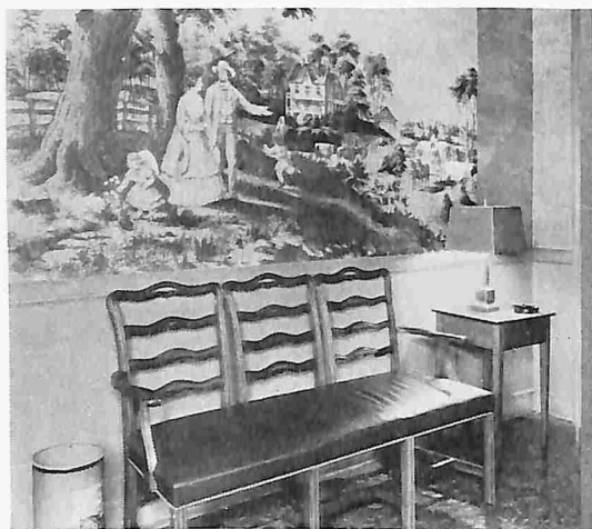
Truly in keeping with the spirit of The American Home is the reception room in connection with its offices, three views of which are shown above. It is done in Early American—maple furniture, hooked rugs,