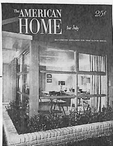
Looking through the large corner windows at the comfortable living room in the Cy Williams Sun Ranch house.