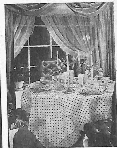
Table Set from the "5 and 10" Style Without Money

In Which One of America's Foremost Decorators Shows You, Step by Step, How Easily You Can Beautify Your Home