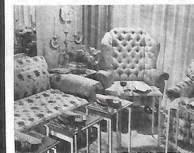
Dinner for Eight Without a Dining Room

How to Get Started Dressing Up Old Furniture China, Silver, Glass, Linen Color Lamps Decorating the Table Smart Accessories and Details Lighting in General Kitchens Comfort Coffee-and-End-Table Accessories Bedrooms Backgrounds Fireplace Bedroom Furniture Doors Accessories Blankets and Linen Windows Hardware Bedroom Closets Walls Picture and Mirror Frames Bathrooms Floors How to Hang Pictures Child's Bedroom Ceilings Accessories for Serving Food in the Dining Room Game Rooms Fireplaces Front Halls Sun Rooms Covers and Curtains Hall Closets Terraces, Awnings Rugs and Carpets Living Rooms Outdoor Furniture Linoleum The One-Room Apartment The Bride and Groom Blinds The Dining Room The Budget Before You Build Unholstered Furniture Dining Room Furniture Index & Bibliography Slip Covers End Tables Coffee Tables Occasional Chairs Desks