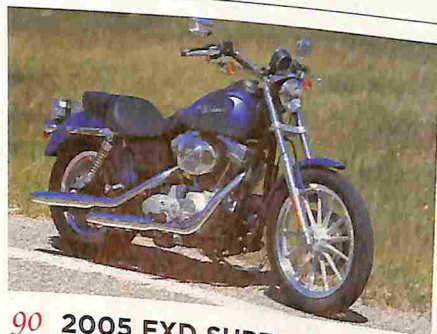
90 2005 FXD SUPER GLIDE Sporting weapon and affordable Big Twin