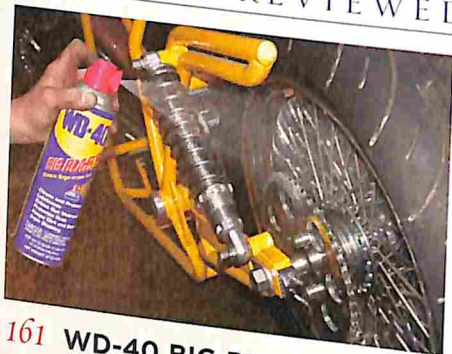
161 WD-40 BIG BLAST A protective fogger for your chrome