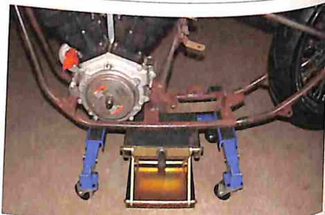
162 K&L SHOP DOLLY & FAT JACK Just what you need for your next bike build