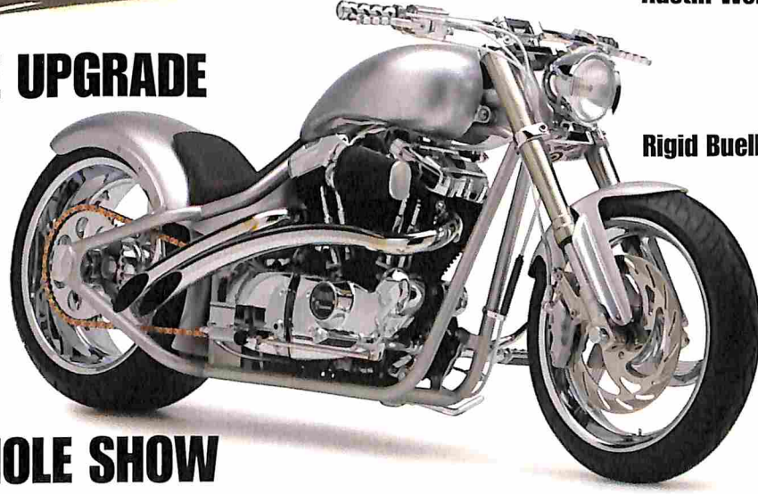
Rigid Buell Custom