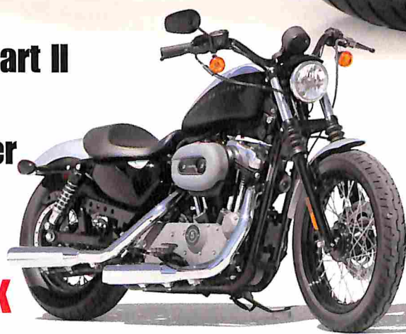
2007 Harley-Davidson Nightster XL