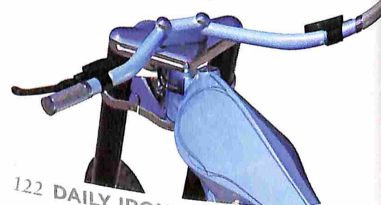
122 DAILY IRON SUPPLEMENT

192 AIM LIBRARY: CUSTOM MOTORCYCLE How to build or modify a bike