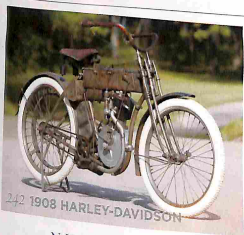
242 1908 HARLEY-DAVIDSON