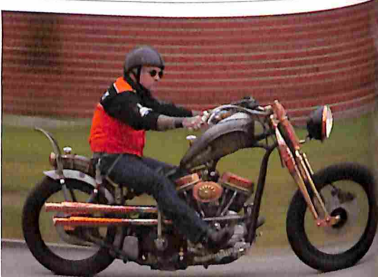
84 NORTHERN EXPOSURE