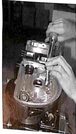
50 INDIAN POWER PLUS 100

SUBSCRIBE TODAY & SAVE! $23.95 A Year For 12 Issues (Half Price). And Get The Buyers Guide FREE! OUTSIDE THE US $36.95 PER YEAR custsvc_ameriron@fulcoinc.com www.AIMag.com Or Call 877/693-3572