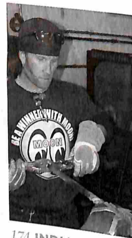
174 INDIAN LARRY LEGACY