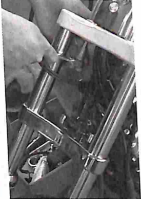
64 TRIPLE TREES