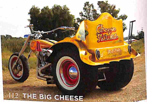
112 THE BIG CHEESE