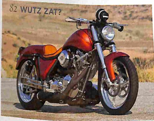
82 WUTZ ZAT?