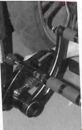
132 FANCY FOOTWORK

118 DUCK SOUP What to build when you tire of Italian bikes