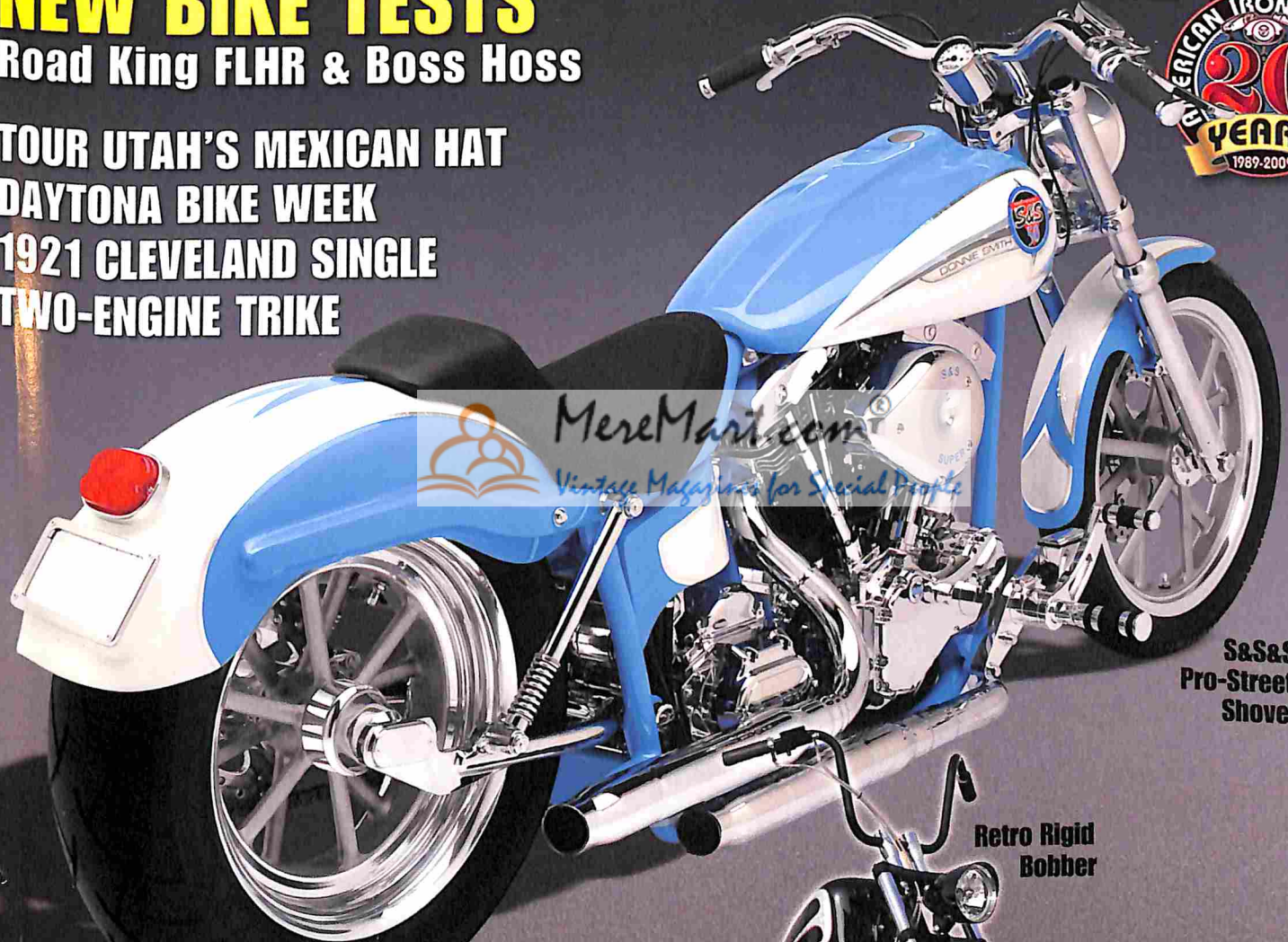
S&S Pro-Street Shovel