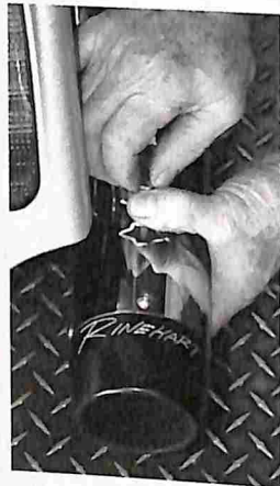
54 $1,500 HOP-UP FOR TWIN CAMS