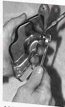
100 ROADLOK CALIPER