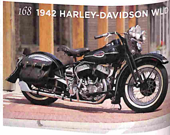
168 1942 HARLEY-DAVIDSON WILD

CLASSIC AMERICAN IRON 168 1942 HARLEY-DAVIDSON WLD A flat-out classic!