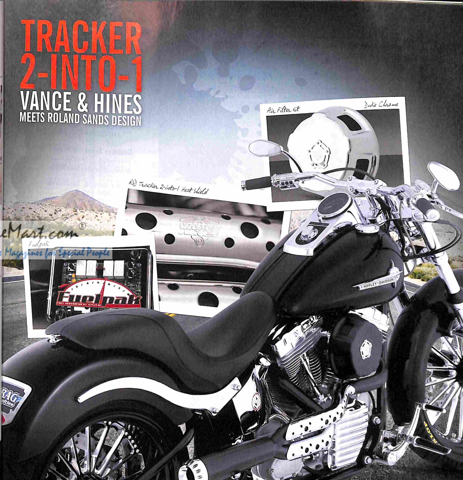
Air Filter kit