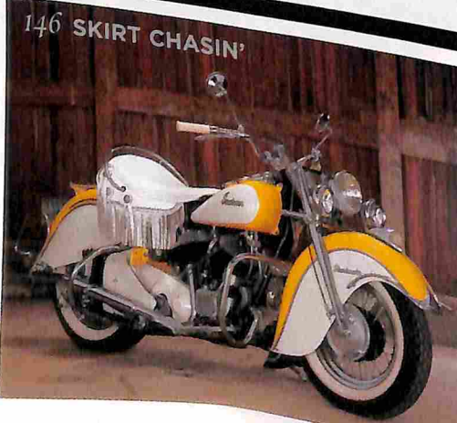
146 SKIRT CHASIN'