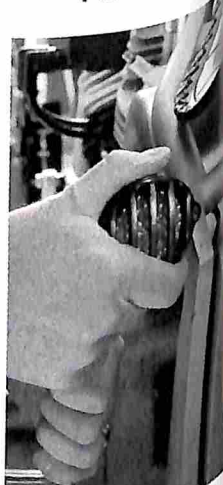
104 2011 DAYTONA GIVEAWAY BIKE