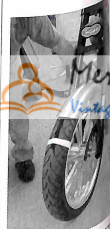
96 FXR FRONT FENDER