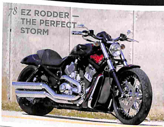
78 EZ RODDER — THE PERFECT STORM