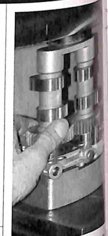
54 AXTELL 88 to 97" KIT