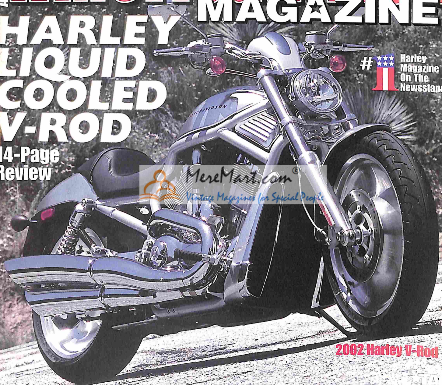
2002 Harley V-Rod

MereMart.com Vintage Magazines for Special People