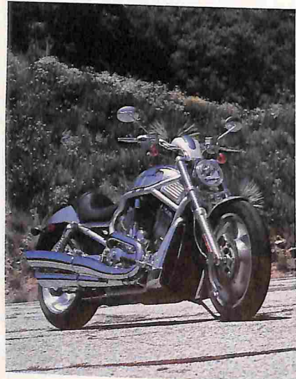
80 COVER: LOW LIQUID LIGHTNING? Harley's new Revolution-powered sport custom