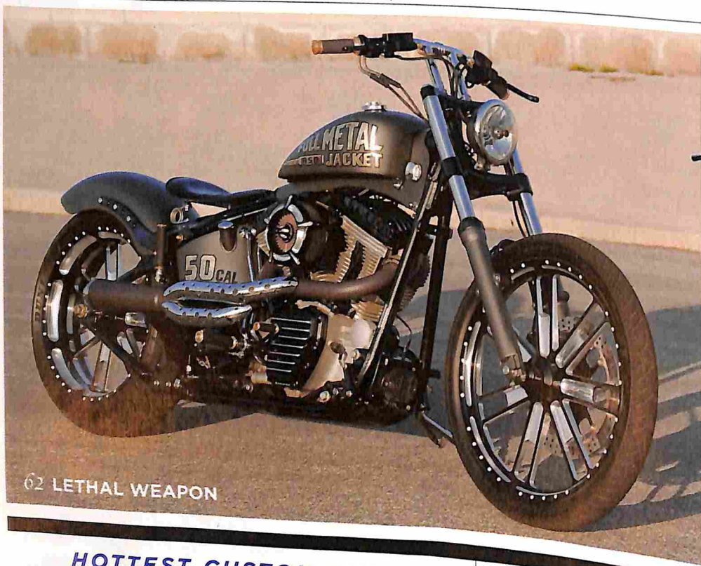
62 LETHAL WEAPON