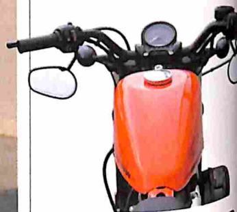
70 2011 SPORTSTER FORTY-EIGHT It rolls as good as it looks