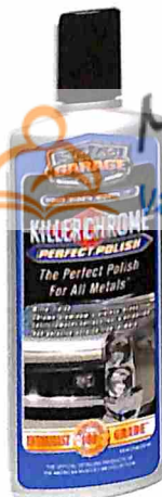
138 KILLER CHROME A metal finish cleaner that's the real deal