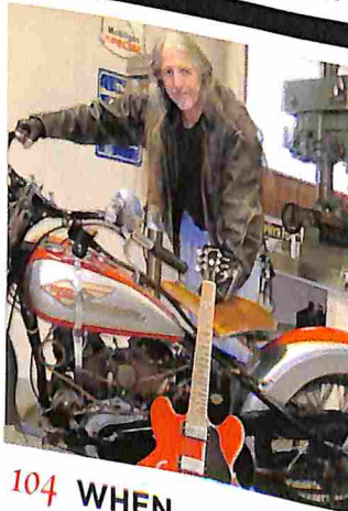
104 WHEN MECHANICS MEETS MUSIC