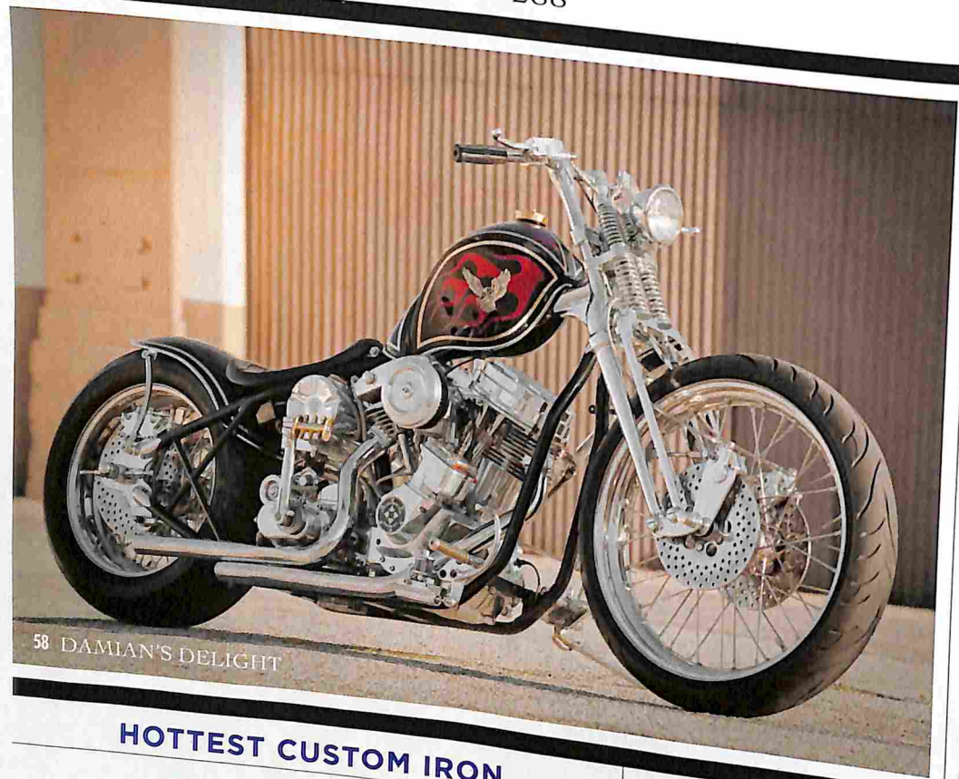
58 DAMIAN'S DELIGHT