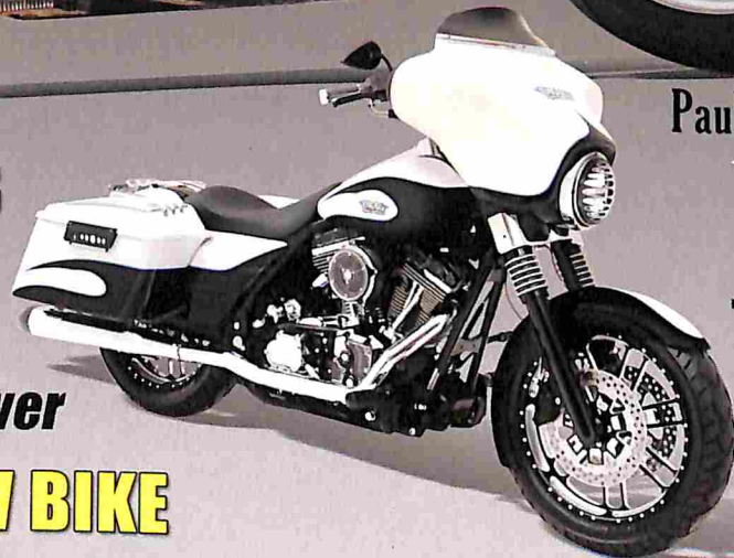
Throwing The Book At An Ex-Cop Bike