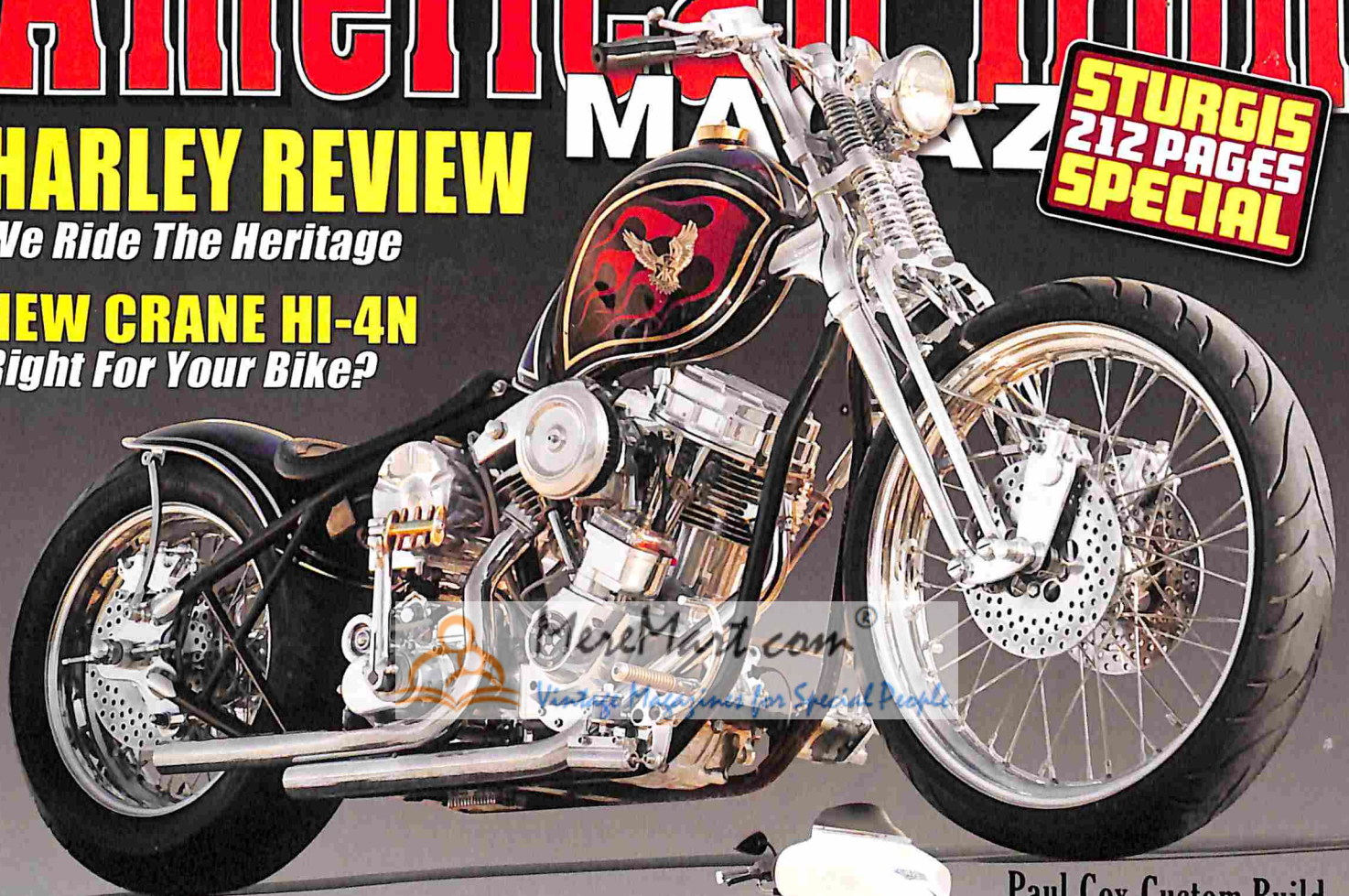
Paul Cox Custom Build