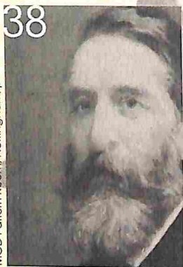
MOD Pattern Room, Nottingham, photo