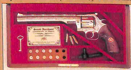
Optional American Walnut Display Case with glass lid. 18"x10"x3". (Bullets not included.)

The Second Amendment .44 Magnum is available exclusively from The American Historical Foundation. To reserve, call toll free, use the Reservation Request or visit. When you reserve, you will be made