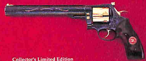
Collector's Limited Edition