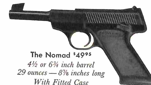
The Nomad $49.95 4 1/2 or 6 3/4 inch barrel 29 ounces — 8 7/8 inches long With Fitted Case