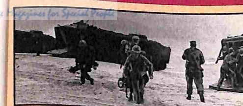
"Dak To, Pleiku, Khe Sanh. A Shau Valley ... Who are the names on the Wall?"

The American Historical Foundation is proud to help draw national attention to the unheralded Americans who fought the Vietnam War and to provide an individual memorial to them, through the world's first limited edition Bayonets, "The Vietnam War Bayonets of Honor."