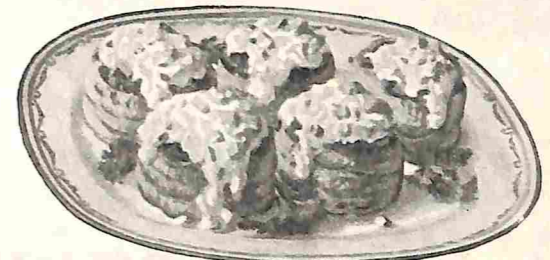
CREAMED STAR HAM PATTIES. See page 22 of "60 Ways to Serve Ham."

Easy-to-get meals can be planned ahead if you start with a whole "Star" Ham