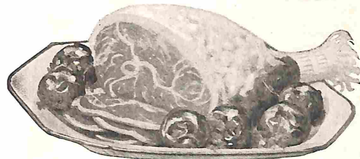
BOILED STAR HAM. See page 6 of "60 Ways to Serve Ham."

Easy-to-get meals can be planned ahead if you start with a whole "Star" Ham