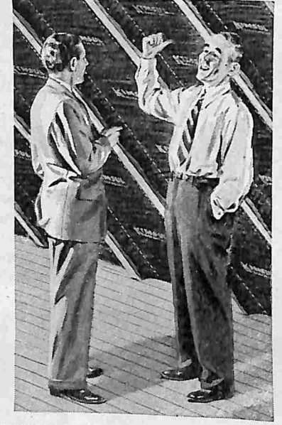
"HERE'S THE ANSWER, MR. BURTON! A few months ago, I installed KIMSUL* Insulation between the beams of the roof, and what a ence it has made is warm