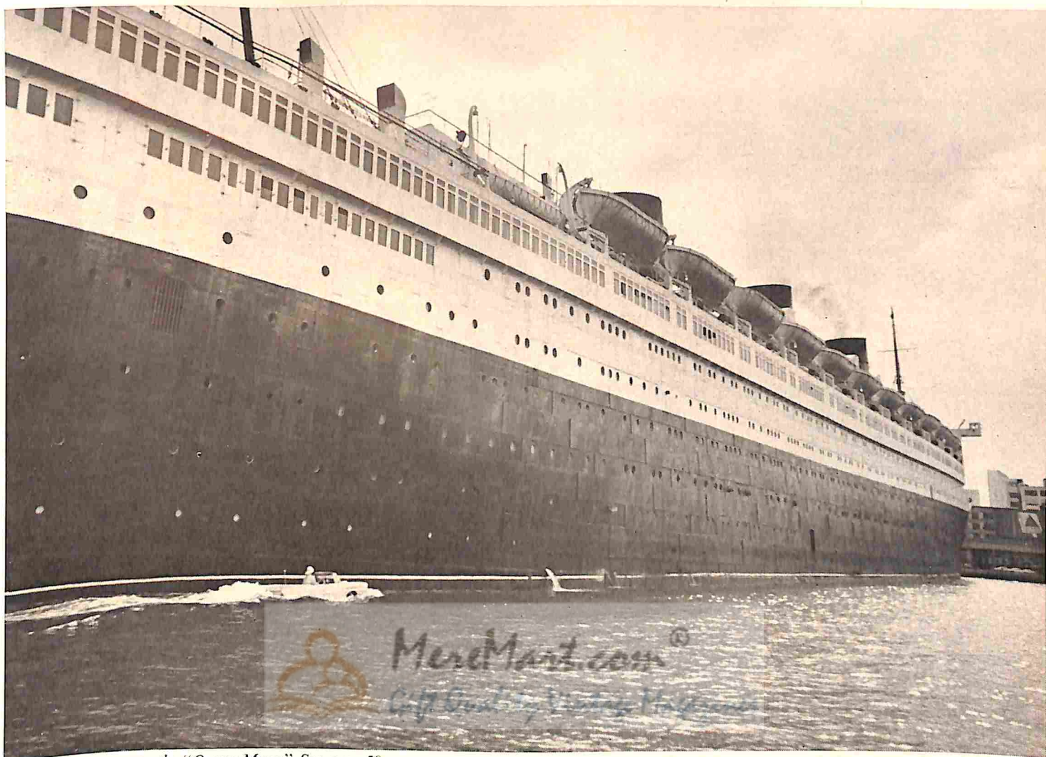
The Amphicar meets the "Queen Mary." See page 50.