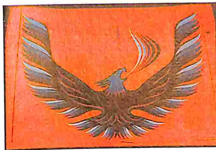
Pontiac blows it.