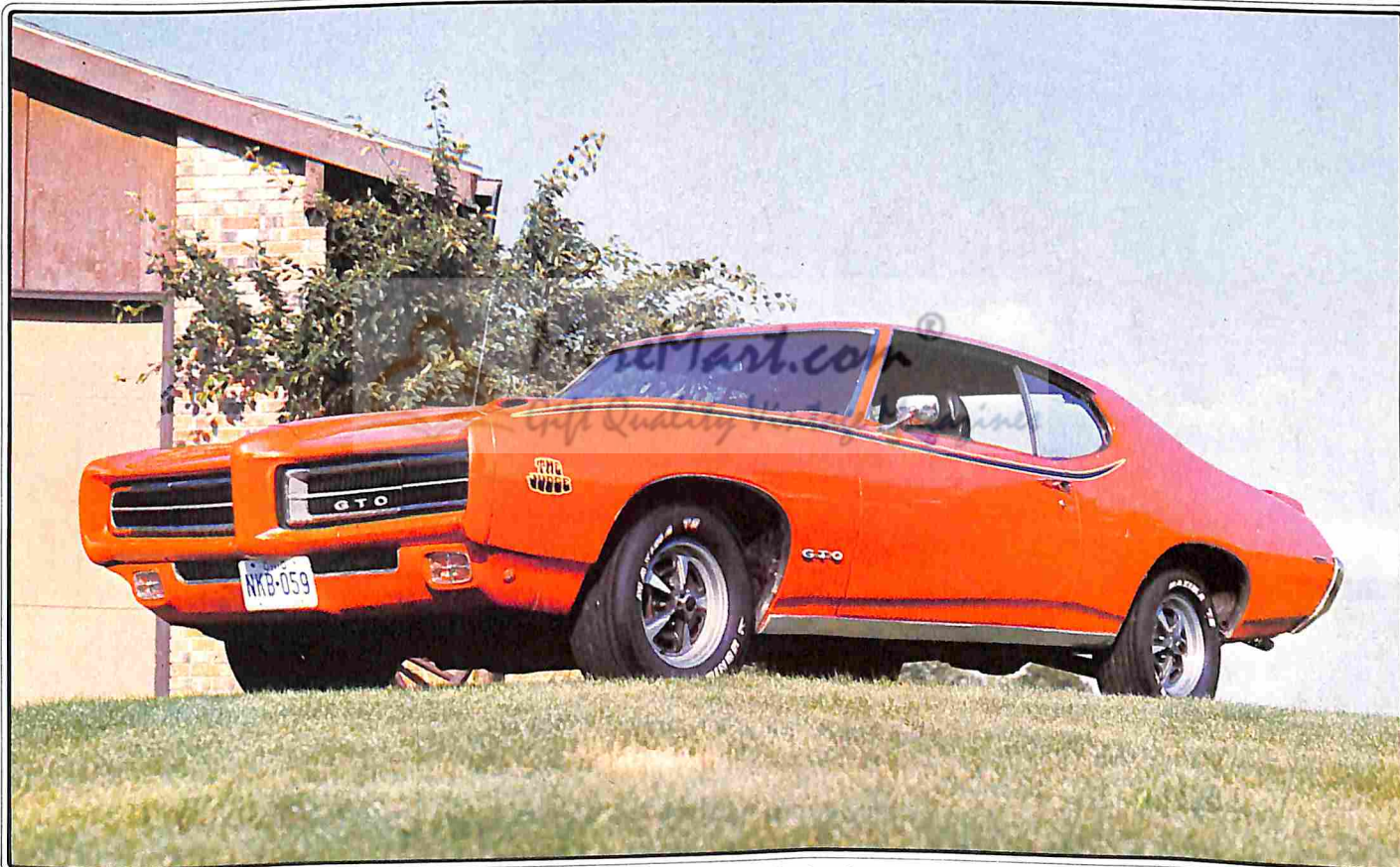
1969 Pontiac GTO Judge