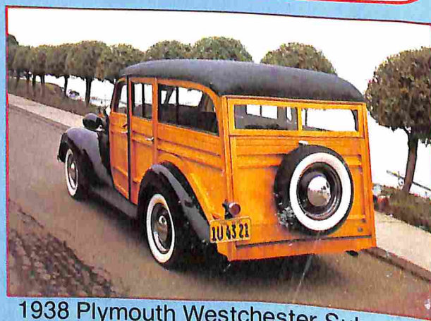
1938 Plymouth Westchester Suburban