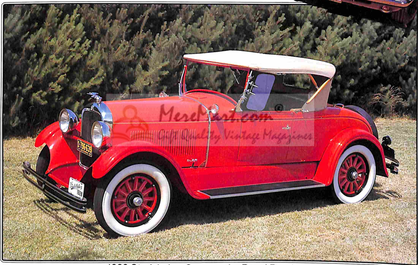
1928 Studebaker Commander Regal Roadster