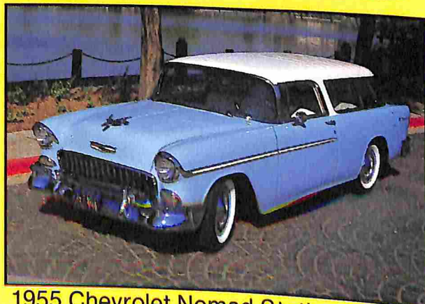
1955 Chevrolet Nomad Station Wagon