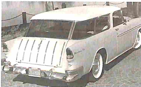
1955 Chevrolet Nomad ... p. 32