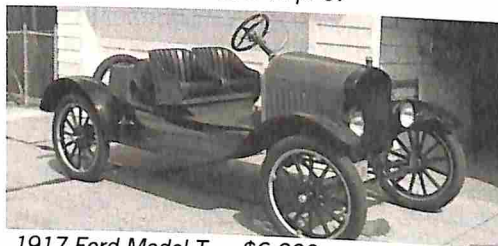
1917 Ford Model T ... $6,800, p. 113