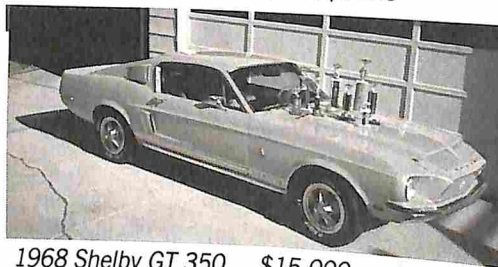
1968 Shelby GT 350 ... $15,000, p. 125