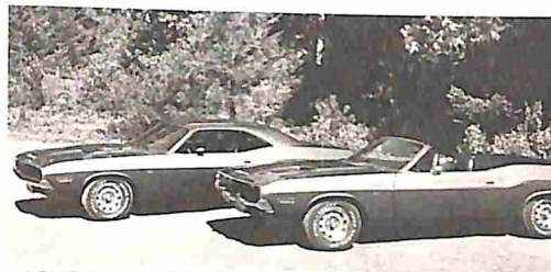
1970 Dodge Challengers ... p. 20