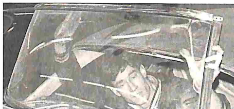
Glass installation ... p. 10