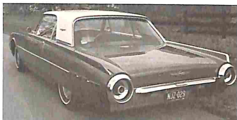
1962 Ford Thunderbird ... p. 16